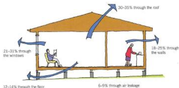
Heat loss in a house - BRANZ

This means two-thirds were built with hollow walls clad with weatherboards, bricks or sheeting, single-glazed wooden-framed windows and generally wooden floors over piles. Making a pretty leaky house that is hard to heat. Insulation can go a long way to keeping your home warm and your power bills down. It makes for a healthier environment, reducing colds and other respiratory illnesses by helping to eliminate condensation, dampness and mould.